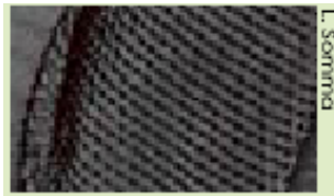
Left: Scarring Electron Micrograph (SEM) of serrations on thorax. Right: SEM of serrations on jugum.

Collection samples taken by Gary Steck and Bruce Sutton (Florida State Collection of Arthropods) for the ATBI have generated several new GSMNP insect records, but it was the discovery of a single male earwigfly that caught our attention. Nearly 20 individuals have since been pulled from summer (June-September) Malaise trap samples from sites at Twin Creeks, Cades Cove, and Purchase Knob, in 2003 and 2004.