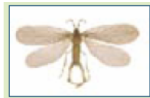
Left: Merope tuber, female. Right: Merope tuber, male.